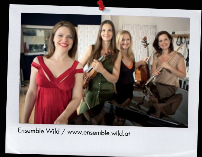
Ensemble Wild / www.ensemble.wild.at

To get an idea of the quality of demo-dissections waiting for you, please visit www.endovienna2012.com