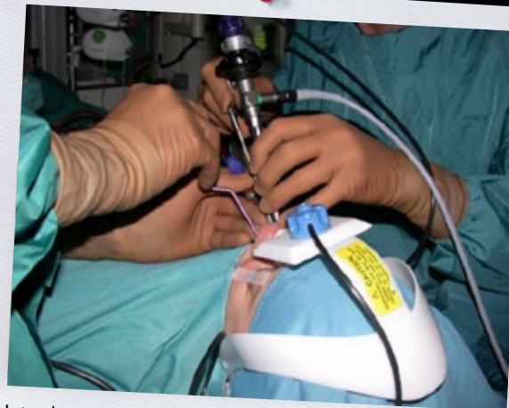
Interdisciplinary Four-Hand Technique

Only participants of the conference may book instructional courses.